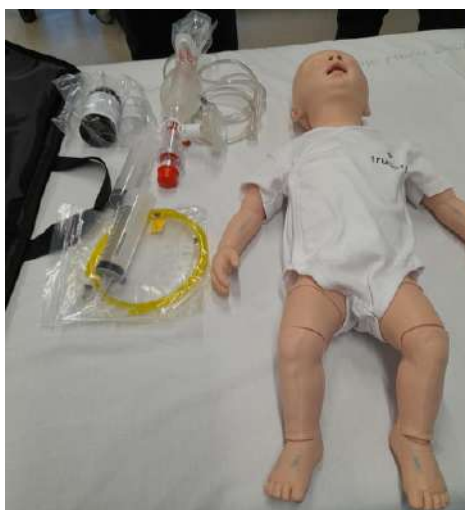
TruBaby with accessories