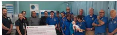
Nurse Educators demonstrating some of the amazing features of TruBaby