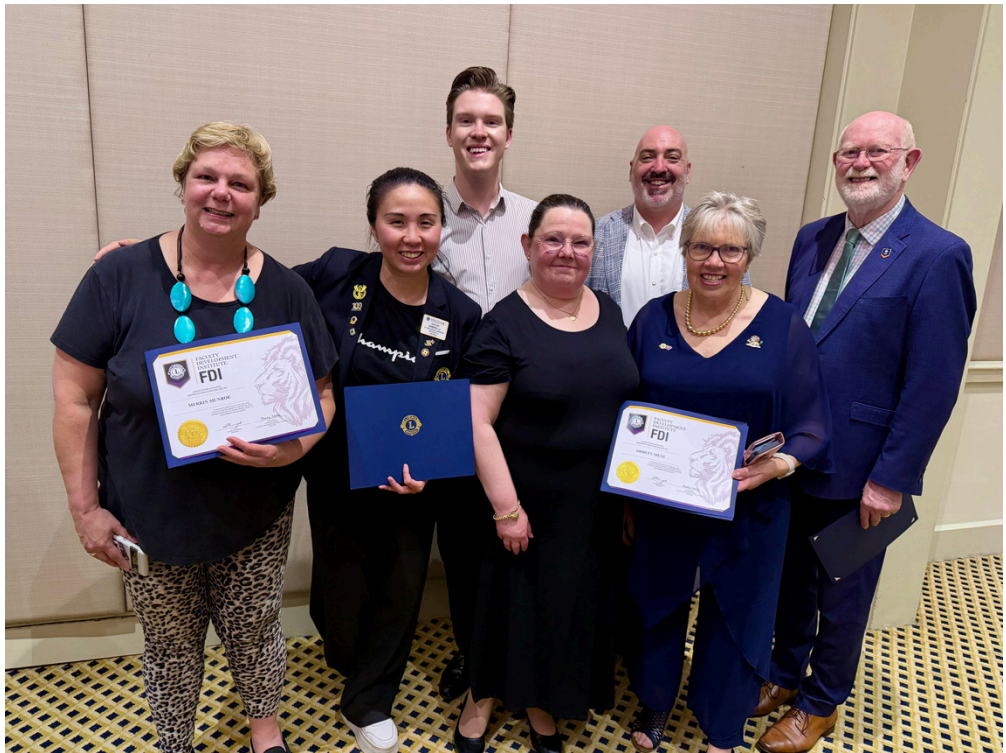
All Victorian attendees

The Institute also offered valuable opportunities to share ideas across districts and countries, learn about different Lions projects, and build cross-district relationships. We gained useful tips from peer-led workshops covering problem solving, effective communication, overcoming obstacles, time management, personal mission statements, and goal setting which we will pass on through our own training sessions.