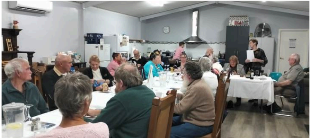
Wellington/Latrobe Lions enjoying the special induction dinner meeting