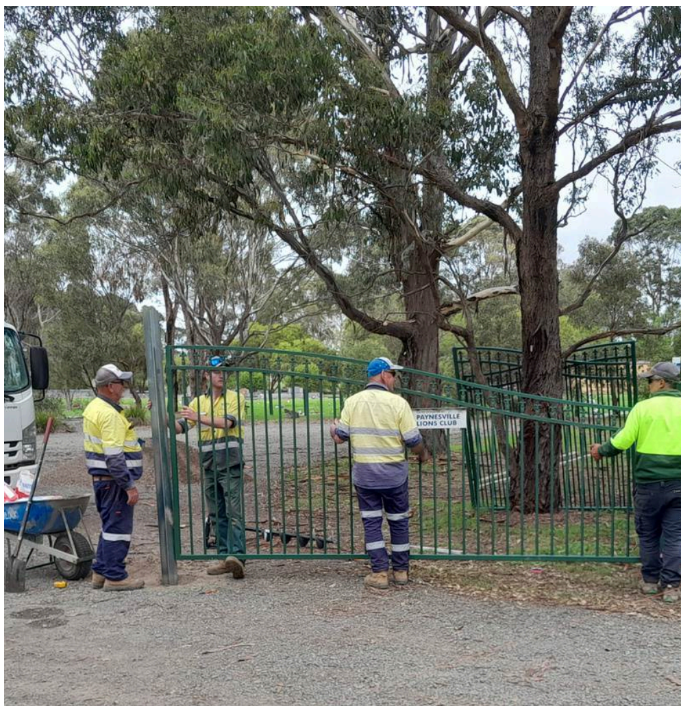
Relocating the gate